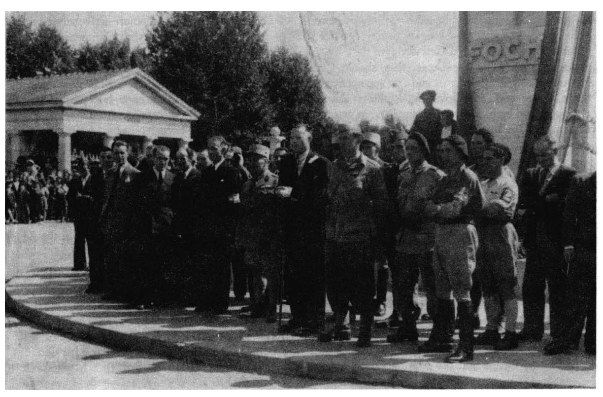
Jeburg Team and Maqui in Tarbes - 1944.

Aside from the fun, the team did quite a bit of work. Their most notable achievement was the capture of a retreating German regiment, complete