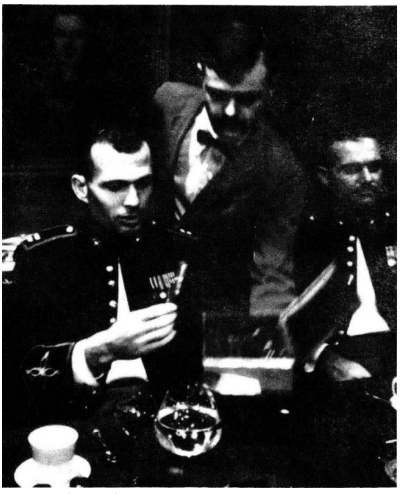
After a pleasant meal, cigars are served.

Several day later Colonel Davis instructed me to extend