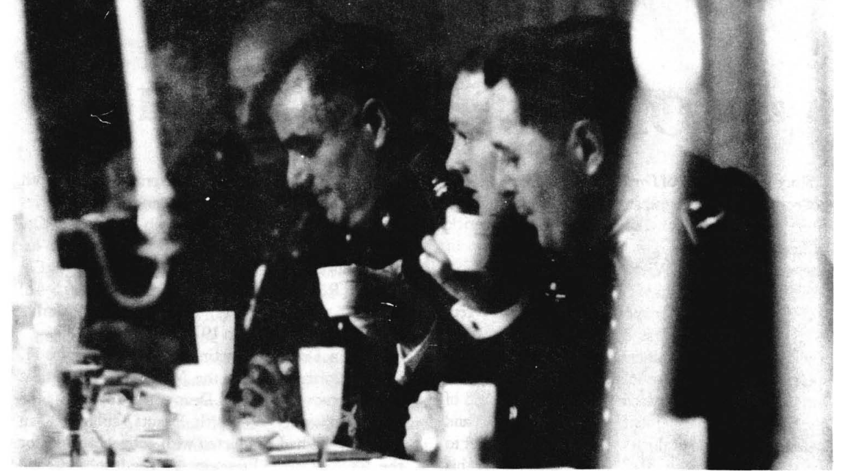
Good food, companions, and conversation—all are ingredients of a successful mess night.

Barracks in Portsmouth. Here again was I impressed by the stirring ceremony of a British officers Mess Night.