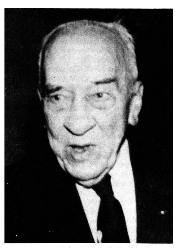
VAdm Settle, 'the Commander' of the Century of Progress stratosphere balloon flight.

After a long period of preparation and delay for